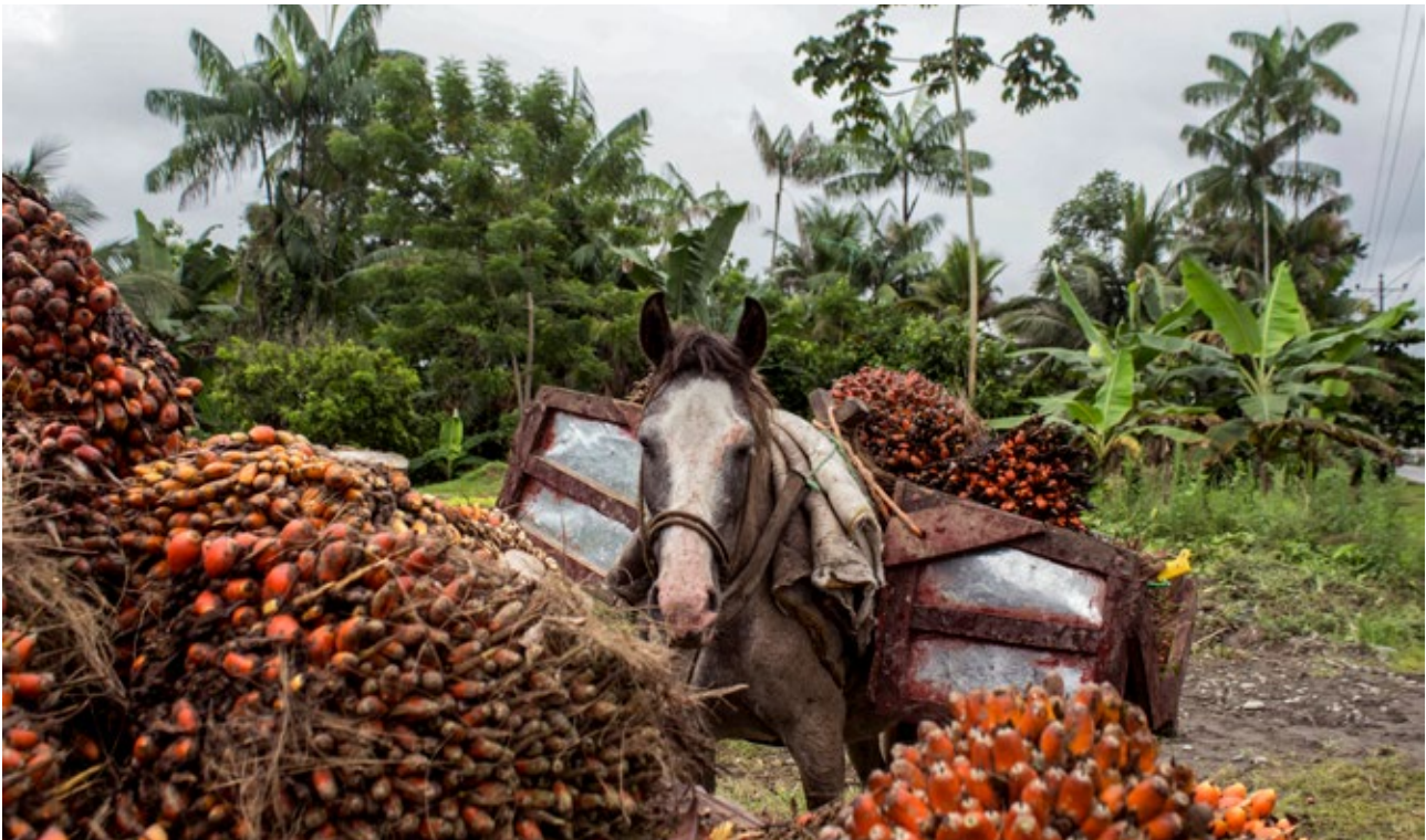
Transport of oil palm fruit in Tumaco, Nariño.