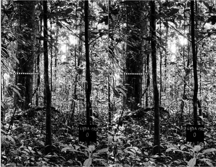
Photo 4.5. Stereoscopic photo of an untreated forest in Mapane region about 20 years after logging.