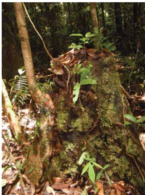
Photo 4.4. A new sprout helped a poison-girdled tree to survive.

In the MAIN experiment, the minimum amounts for ingrowth were met where silvicultural treatment had been applied, but logging without silvicultural treatment resulted often in inadequate ingrowth (see Table 4.11). The impact of logging intensity on ingrowth could not be proven, but the positive effect of silvicultural treatment could be shown with ANOVA ( p = 0.046 ). The differences between both refinement treatments (SR18 and SR14) on the one hand and the control treatment (S0) on the other hand were also significant when tested with Fisher's t-test ( p = 0.03 and p = 0.04 respectively). However, the difference between the effects of both refinement treatments was not evident ( p = 0.69 ).