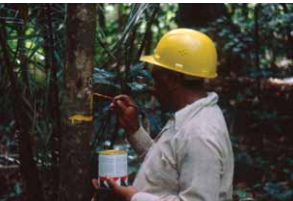
Photo 4.3. Numbering the tree and marking the point at which the diameter is measured. Mapane, 1982.

1986; Jonkers 1987) that the diameter growth of medium-sized and large commercial trees is stimulated by refinement, and that a 20-cm diameter limit refinement leads to faster growth than a 30-cm diameter limit treatment.