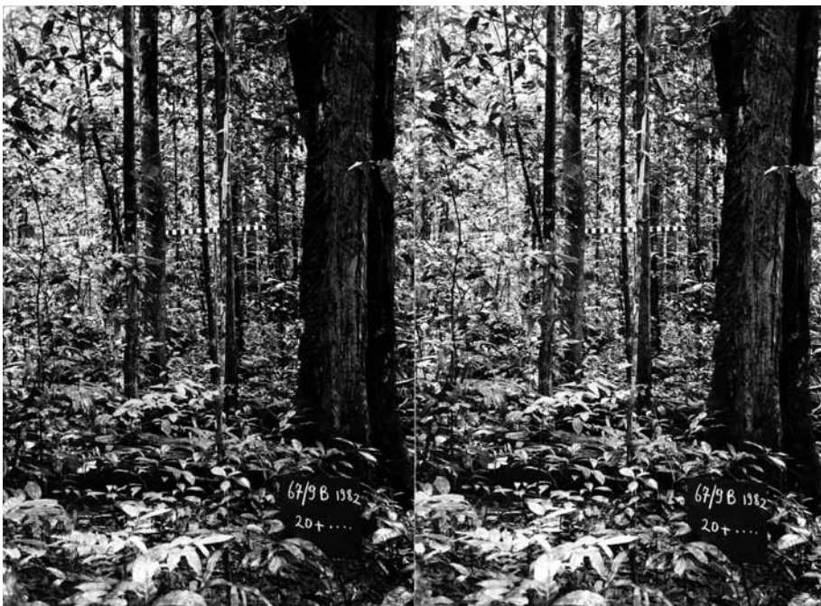
Photo 4.6. Stereoscopic photo of a forest in Mapane region 7 years after refinement.