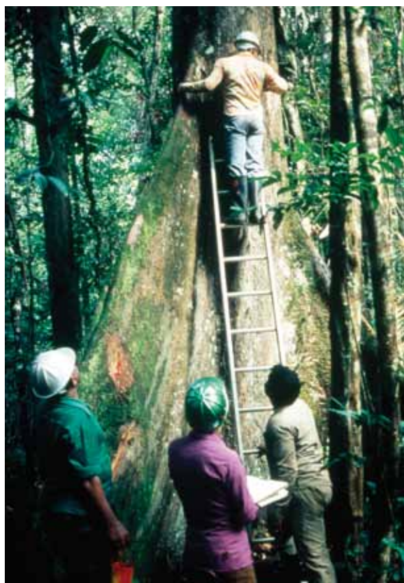
Photo 4.2. Measuring a stem diameter above the buttresses.

the idea was that the research would lead to a monocyclic management system. Hence, all trees above the refinement limit were killed, except trees of commercial species which were likely to be still in good condition at the end of the rotation of 60-80 years, that is, good quality stems which were less than 50 cm in diameter (Boerboom 1965, appendix 32). In experiment Akintosoela1, which was established in 1975, this 50 cm upper diameter limit for commercial species was not applied, but poor stem form and other defects remained reasons to reject and eliminate timber trees (Staudt 1977). In the MAIN experiment, all trees of commercial species were retained, except for a few visibly hollow or extensively decayed stems and split or broken trunks (Jonkers 1983, 1987). Furthermore, when the Mapanebrug experiment was established, there were only 31 entries on the commercial species list, while a list of 58 species was applied in the other experiments. Hence, in refinements with a 20 cm diameter limit, basal area was reduced to about 7 \text{ m}^2.\text{ha}^{-1} in Mapanebrug, to 9.8 \text{ m}^2.\text{ha}^{-1} in Akintosoela1 (De Graaf 1986) and to about 14 \text{ m}^2.\text{ha}^{-1} in the MAIN experiment (Jonkers 1983) 3 . For comparison: the basal area in undisturbed forest is about 30 \text{ m}^2.\text{ha}^{-1} .